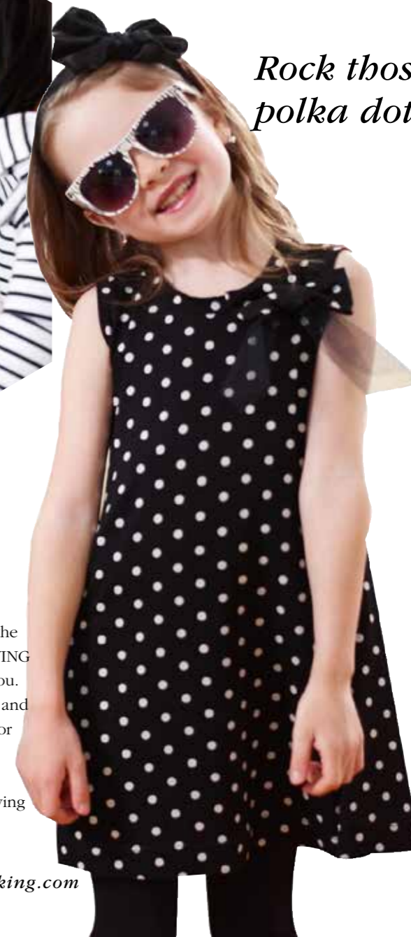
The black and white polka dot dress is made in stretch fabric using stretch stitches.