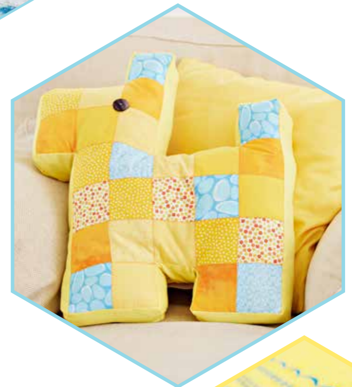
This colorful Scotty Dog Pillow is sewn from scraps of fabric leftover from other projects. Instructions can be found on www.busquarnaviking.com

The Personalized Quilt Label was made using one of the built-in sewing fonts. You can program and save personal stitch settings to the "My Stitches" menu.